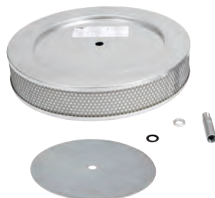
Optional HEPA filter