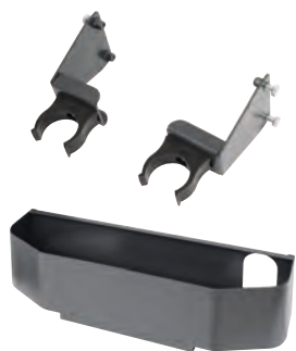
Optional accessory and hose holder.